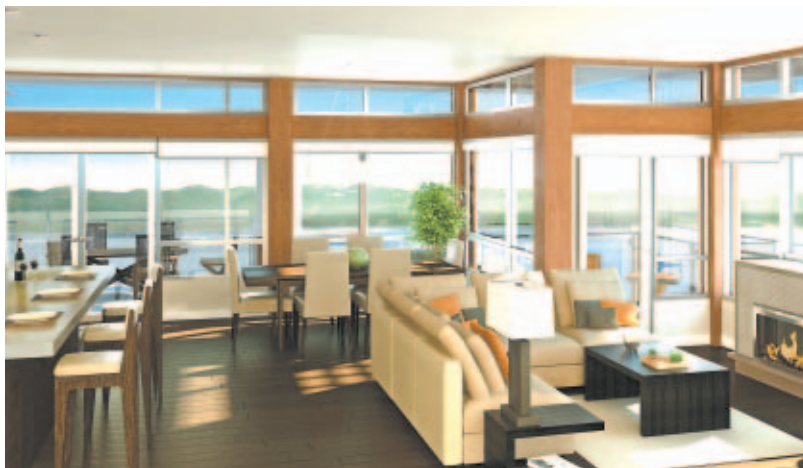
Large floor plans and generous flows of light and air offer an exquisite living space, where you can entertain guests or just sit back and enjoy the magnificent surroundings.