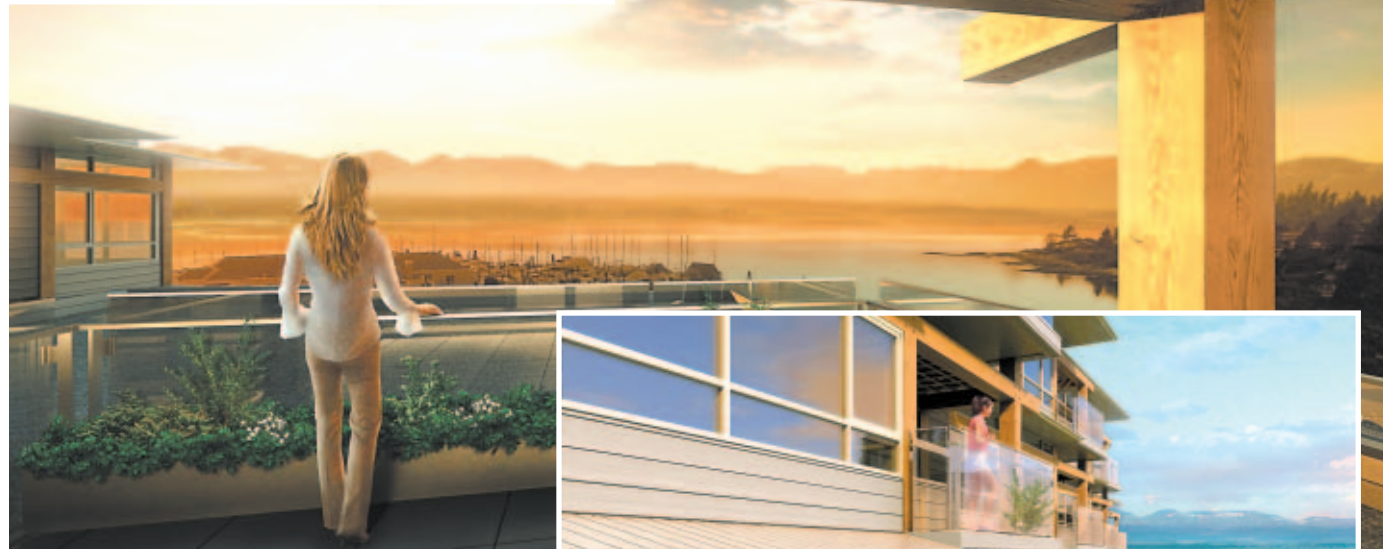
The Mandira development offers stunning views overlooking the ocean-side mountain landscape.